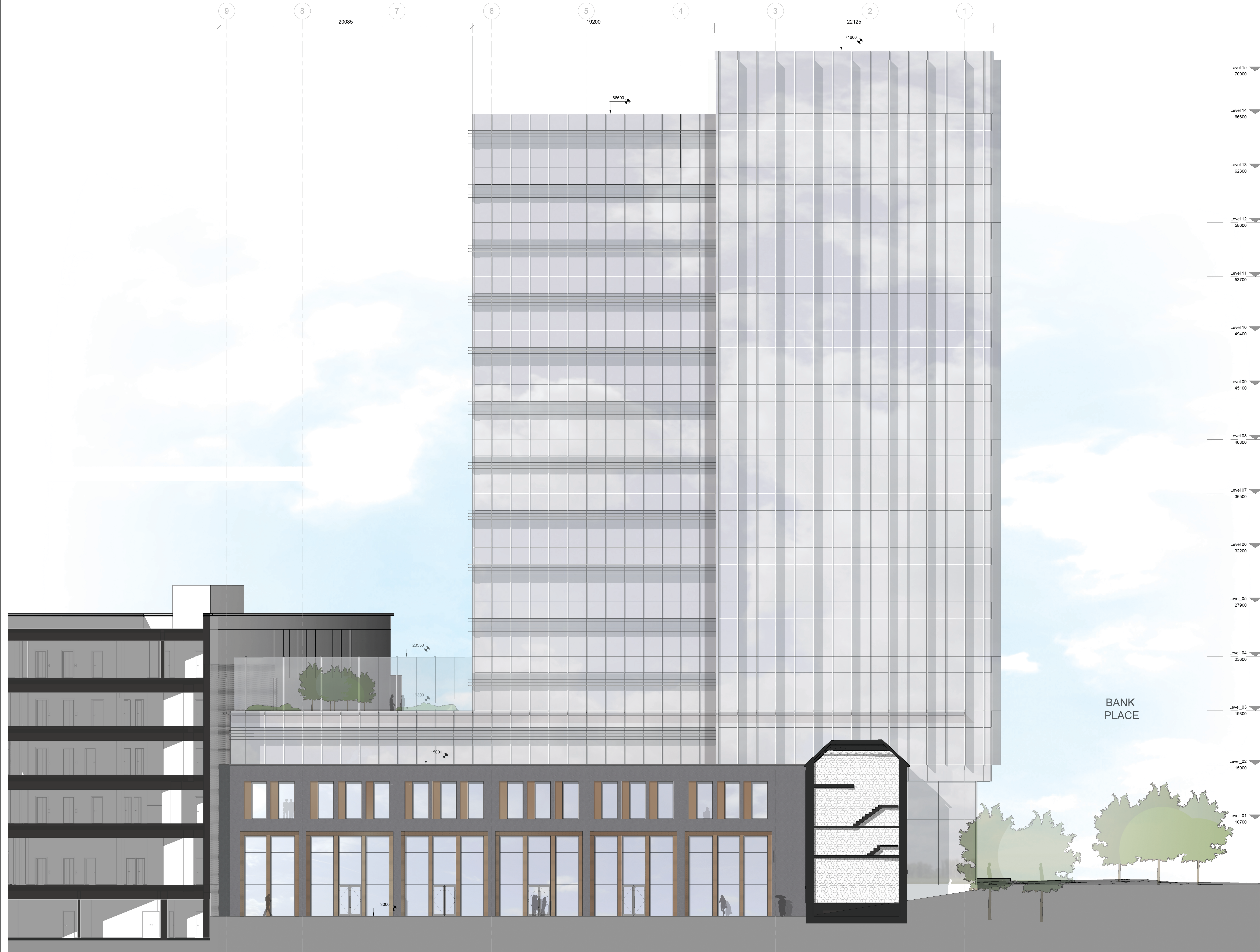
1 | East Elevation SCALE: 1 : 100

For Site Levels refer to Landscape Architects Drawings All levels referenced to Malin Head Datum KEY PLAN